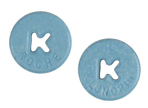
Klonopin 5mg tablet

Most depressants are controlled substances that range from Schedule I to Schedule IV under the Controlled Substances Act, depending on their risk for abuse and whether they currently have an accepted medical use. Many of the depressants have FDA-approved medical uses. Rohypnol® and Quaaludes® are not manufactured, legally marketed, and have no accepted medical use in the United States.